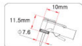
SMALL HEAD SIZE